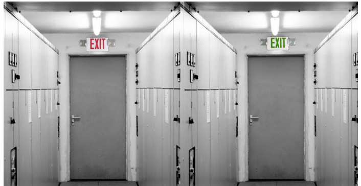
Application: Supermarkets, offices, shopping malls, hotels, hospitals, schools, and more commercial and industrial applications